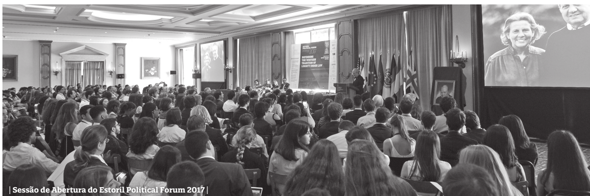
| Sessão de Abertura do Estoril Political Forum 2017 |