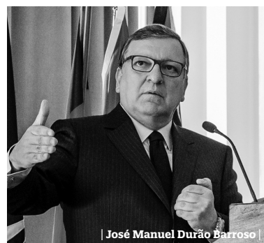
| José Manuel Durão Barroso |